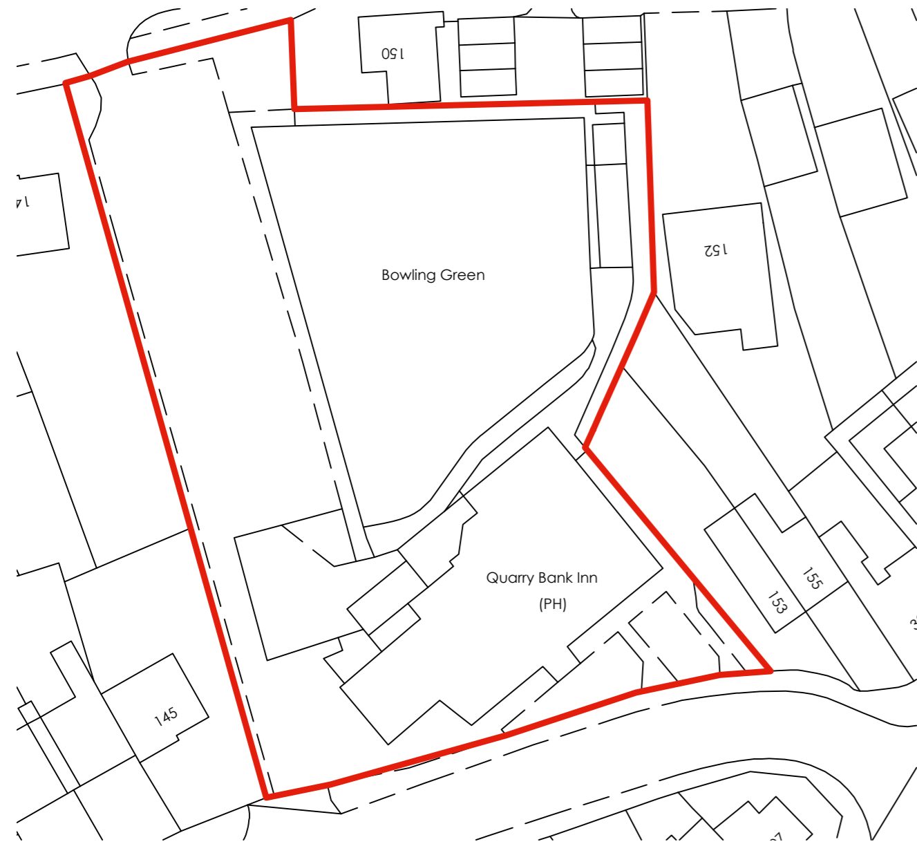
PROPOSED SITE PLAN (1:500)

— REGULATED ENTERTAINMENT — SALE OF ALCOHOL